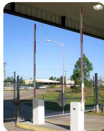
Access control options